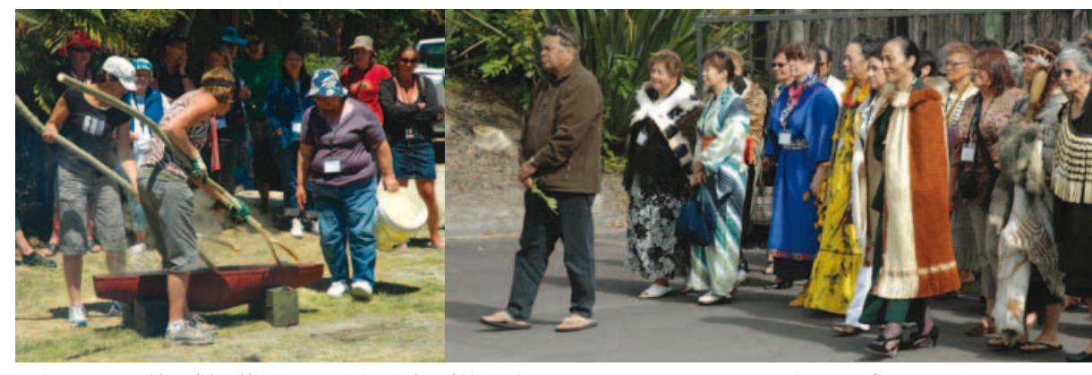
Dyeing garments with traditional hot water steaming, and powhiri on Taiwere Marae at Te Wānanga o Aotearoa in Rotorua for an indigenous weavers symposium planned for and funded by Ngã Pae o te Māramatanga during 2009